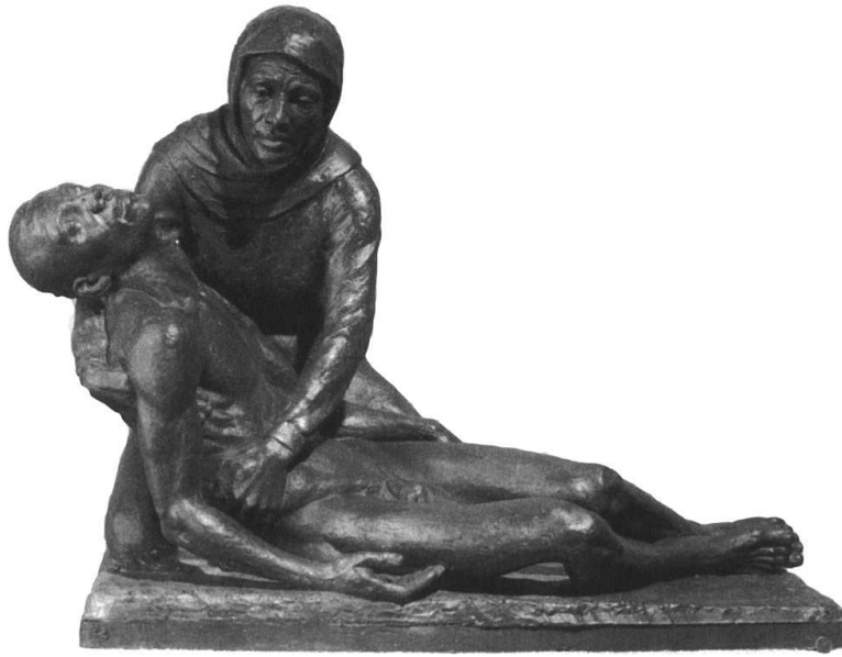
Figure 3-3. Richmond Barthé, The Mother , painted plaster, approximately life-sized, destroyed 1940. Photograph from the National Archives, Washington D.C. Taken from Vendryes 169.