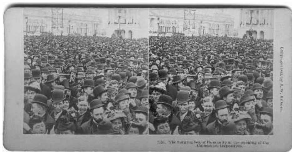
Figure 3-1. Benjamin W. Kilburn, The Surging Sea of Humanity at the Opening of the Columbian Exposition , 1893. Taken from Esteve 134.